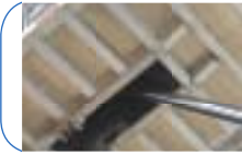
FLOOR HOIST BOX FRAME-OUT: Provides superior strength.