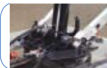
FRAMELESS COUPLER ASSEMBLY