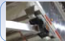
FRAMELESS CENTER BODY PIVOT