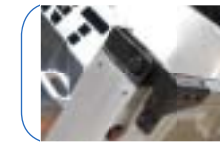
STEEL BOLT ON OVERSLUNG TAILGATE HINGE ASSEMBLY: Standard steel overslung tailgate hinge assembly provides excellent strength.